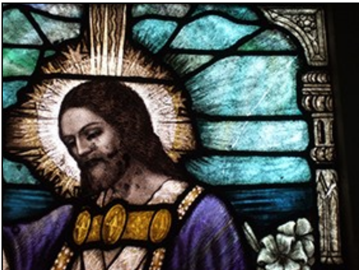
Malmesbury war memorial, Wiltshire, WMO130671