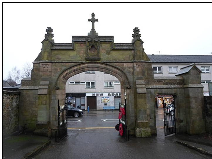
Campsie (Lennoxton) war memorial, Dumbartonshire, WMO165084