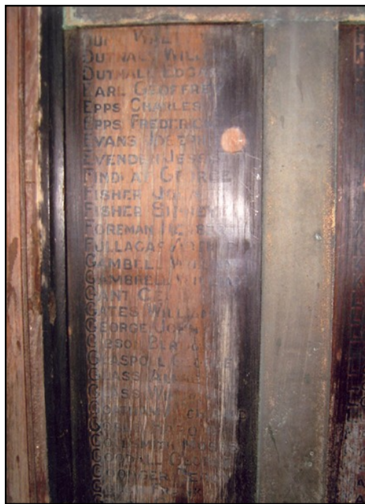
War Memorial 4