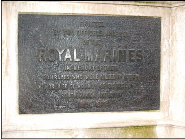
Royal Marines South Africa and China war memorial, London, WMO112036