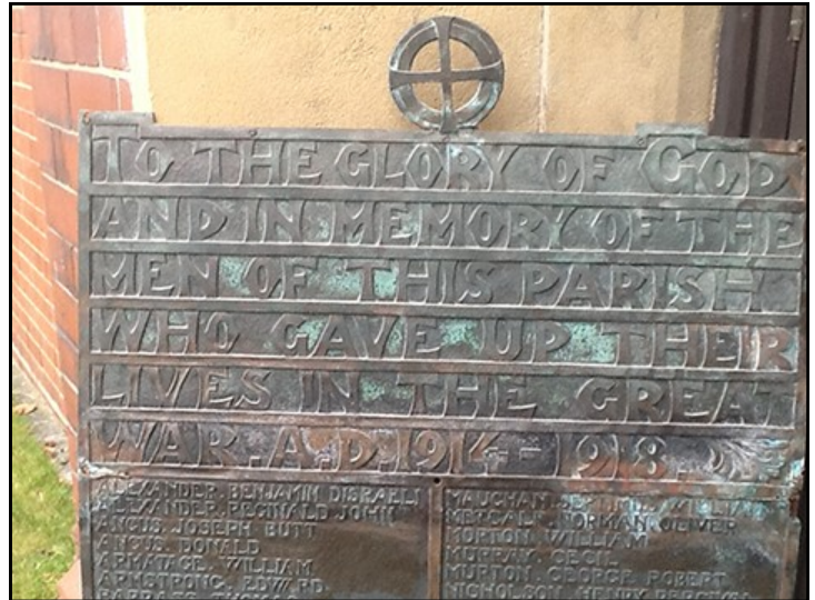
War Memorial 3