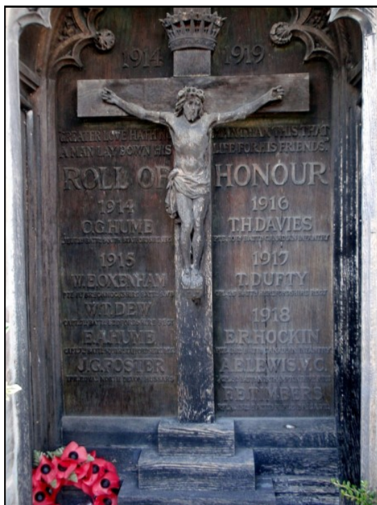
Whitney war memorial, Herefordshire, WMO182529