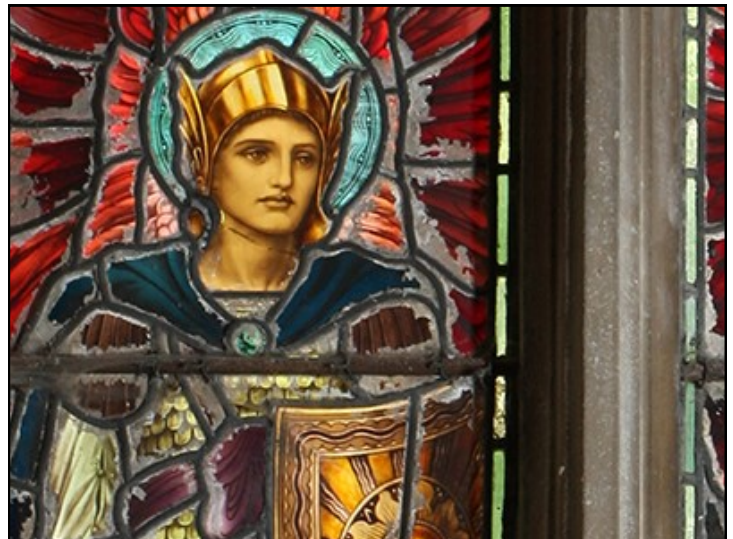
War Memorial 4, © Brian Flint 2011