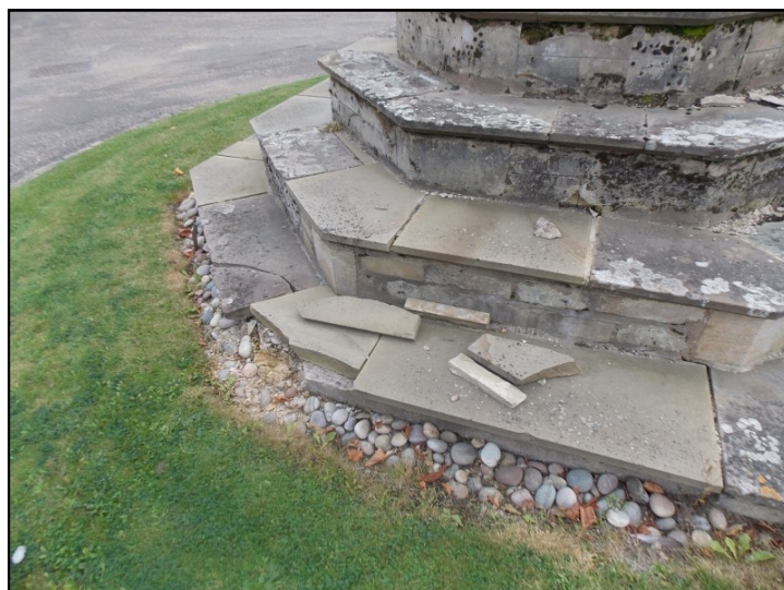
War Memorial 2